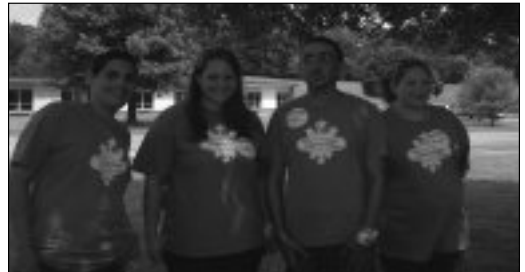
These young people embody the spirit of survival in Hudson Valley.

Five patient families joined the ride on a beautiful sunny morning, touring the scenic byways of the Catskills before returning to Central Valley Elementary School for the Celebration of Life.