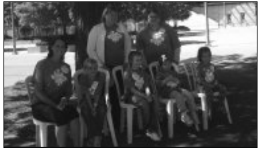
Indianapolis is home to stars of all ages.

Indianapolis Ride for Kids® participants got the thrill of a lifetime on Sept. 12, taking a lap around the world-famous Indianapolis Motor Speedway during their event. The 175 attendees raised $27,781 for the PBTF.