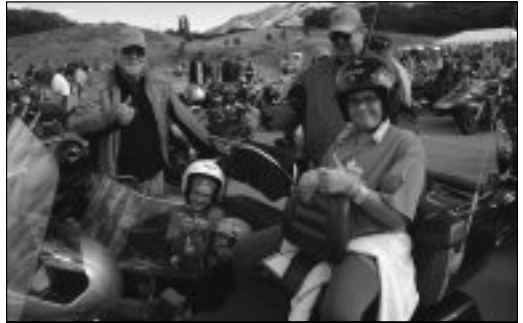
These riders eagerly anticipate their trip through the Wasatch Mountains.

Saturday, Aug. 14 was a gorgeous day in the Wasatch Mountains, especially at the sixth Utah Ride for Kids®.