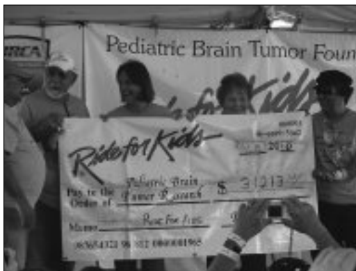
Volunteer ride organizers have a lot to smile about in Louisiana.