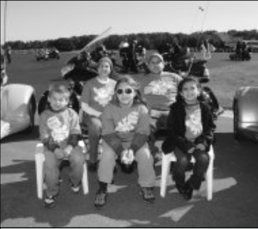
Tampa Bay's event featured bright stars and sunny skies.