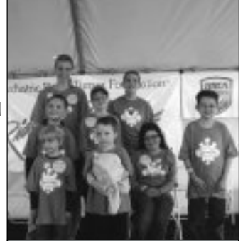
Kansas City celebrates the lives of these star survivors.

Nine local brain tumor survivors attended the event at Overland Park's Johnson Community College. Many of them were sidecar passengers on the ride through