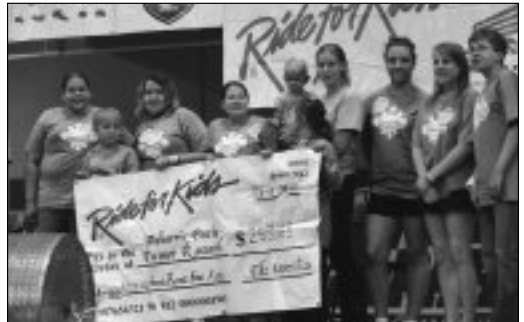
Chicagoland's stars proudly display the amount raised for research and family support.