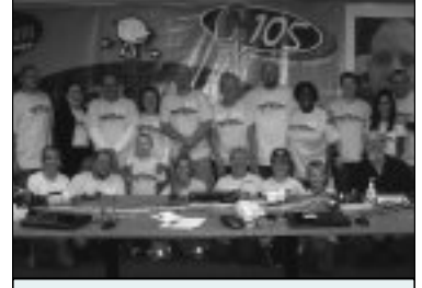
Bob's Buddies is a joint effort between the staff of G105 and the PBTf, brain tumor patients and their families, and community volunteers.

The PBTf's radiothon program raised over $230,000 in 2010. Our next events are in February 2011 in West Palm Beach, Fla., and Phoenix.