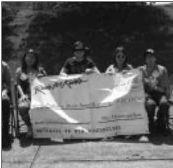
Fundraisers in Pittsburgh are making a difference to these children.