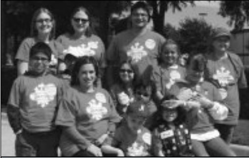
These survivors are the reason motorcyclists ride with us in Grapevine.