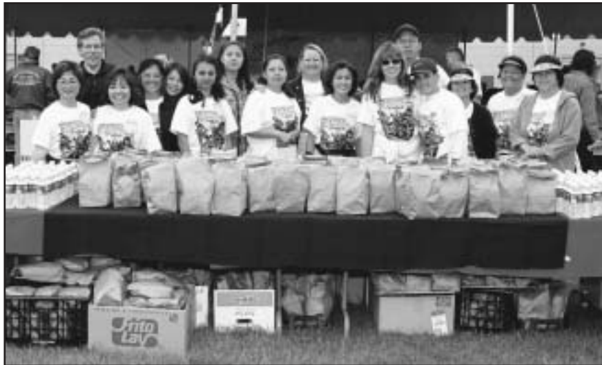
Honda volunteers at the Torrance Ride for Kids®.