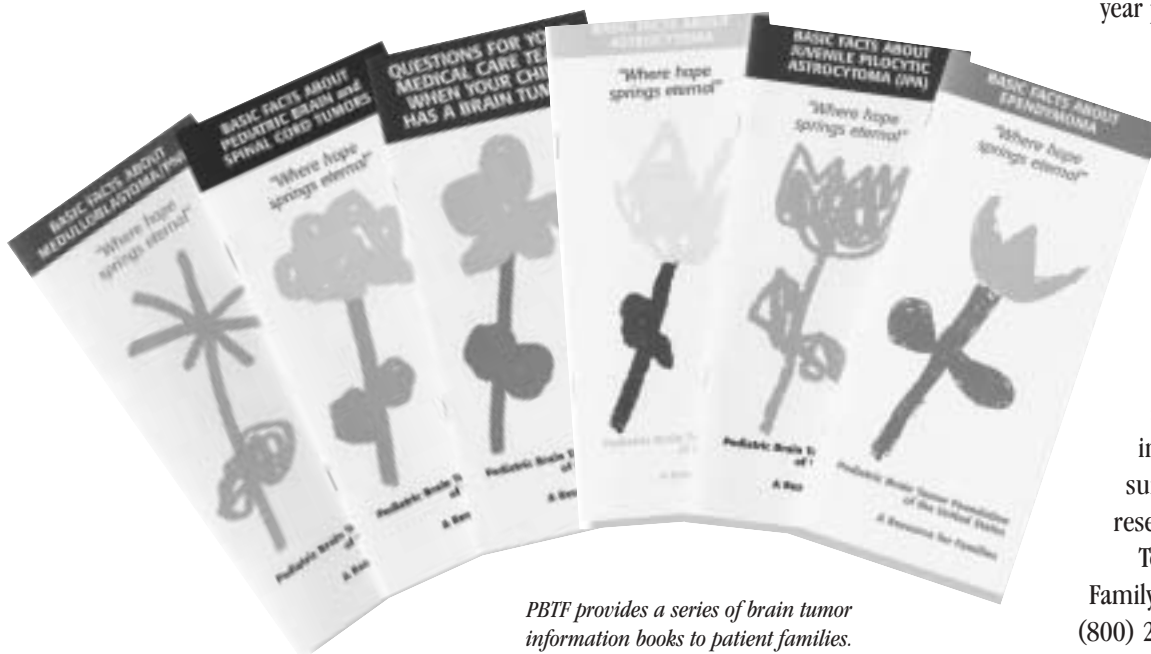
PBTF provides a series of brain tumor information books to patient families.