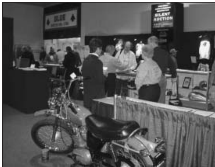
Attendees browsed the silent auction at the Cycle World Joseph C. Parkhurst Education Fund Auction.