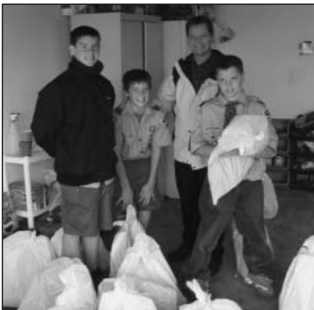
Volunteers from Roseville, CA Boy Scout Troop 1 (dads and sons) prepare luminaries for delivery.

The Breuer family hoped to sell 1,000 luminaries in bundles of five or ten, and enlisted the help of Nick’s former Boy Scout Troop 1 in Roseville, CA and Rich Breuer’s Cub Scout Troop. They ran an ad in the newspaper, and received coverage in the newspaper and from a