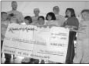
Ride for Kids® "Stars" present the Big Check at the 2003 Ann Arbor Ride.