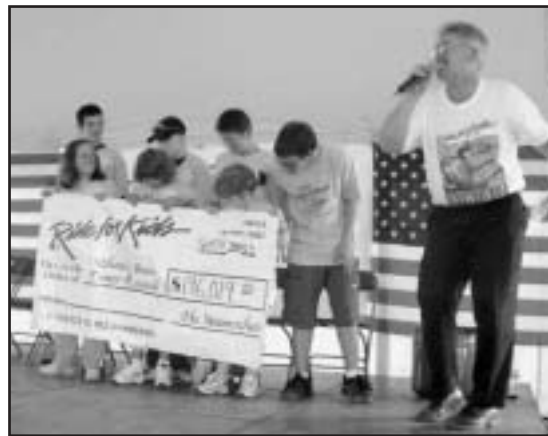
On stage at the Celebration of Life program, the "Stars" celebrate another successful Columbia Ride for Kids® event.