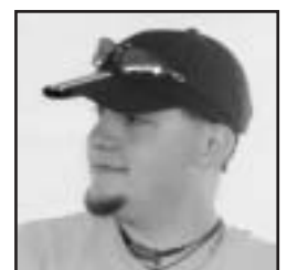
Will Vossen Academy College Bloomington, MN