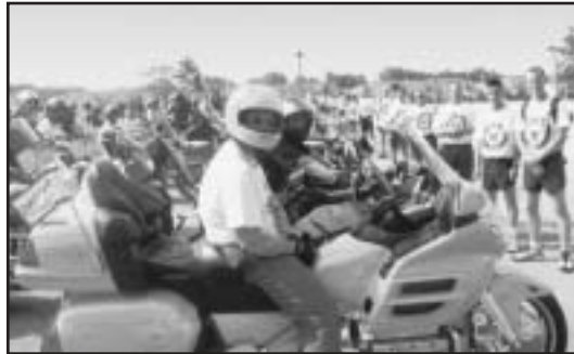
Participants await the beginning of the 2003 Chicagoland Ride for Kids®.

Since 1989, motorcyclists and fundraisers in the Chicago area have worked diligently to raise funds to support the Foundation's research and family support programs. In 2003, the 15-year-old Ride topped all of the 2003 Ride for Kids® events with the most participants and the most funds raised. Since its inception, the Chicagoland Ride for Kids® has raised more than $2 million in total funds.